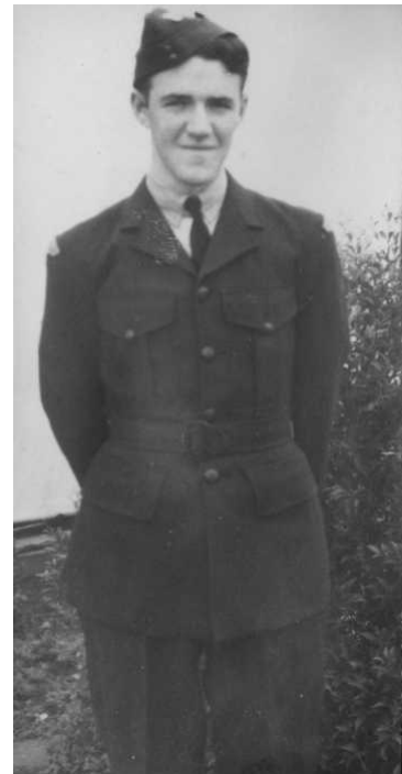
In Air Training Corps Uniform. 1942

we endeavoured to scrape it off his trousers. Nobody was very worried about his pants – he probably would not need them again for a long time. (In fact, he was never to need them