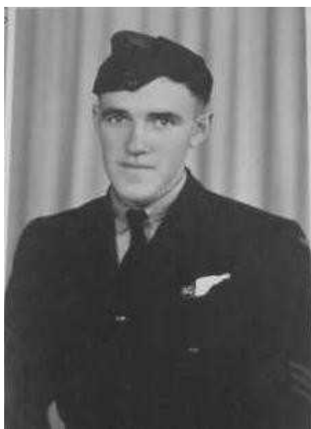
The new Sergeant – 18/12/1943 On Final Leave.

I was posted to No 2 ED (Embarkation Depot), which was also at Bradfield Park where I had done my initial training. Before reporting there, I was given Final Leave. It was a strange period with all my family and friends trying to be as normal as possible yet knowing that this might well be the last week I would ever spend at home. At the end of my leave, I said my 'goodbyes' without too much emotion, as we were not a very demonstrable family, and caught the train to Melbourne. It was the usual slow journey taking anything up to eight hours.