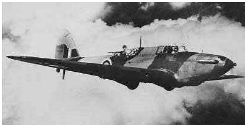
Fairey Battle with trainee air gunner..

During this manoeuvre, we were subject to forces several times the force of gravity as the aircraft changed from level flight to commence its climb, whilst in the stall turn we became