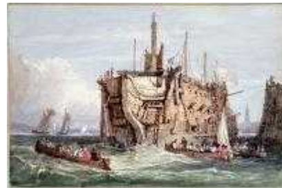
Conditions on the prison hulks were terrible.

Later they were given straw mattresses and their irons were removed.